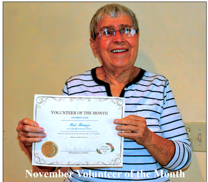
November Volunteer of the Month

Every meeting provides the opportunity for prizes in the Raffatunity drawing. Donations are provided by local, civic-minded businesses.