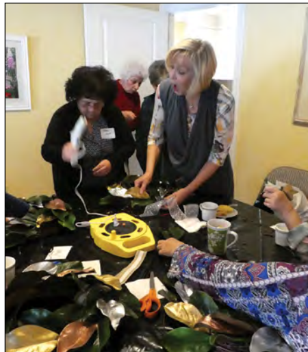
Making a Wreath for the Holidays