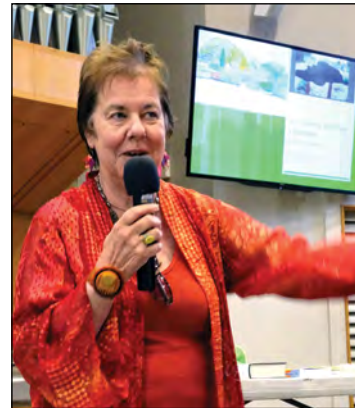
November Meeting Snapshots