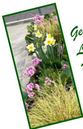
George Lucas Plaza